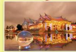
Taiwan Glass Gallery