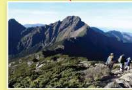
Yushan National Park