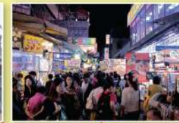
Fengjia Night Market