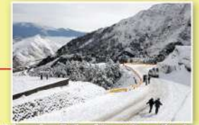
Hehuanshan National Forest Recreation Area