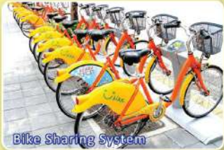
Bike Sharing System