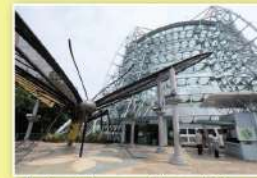
National Museum of Natural Science