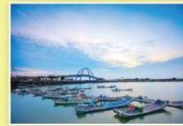
Wangung Fishing Port