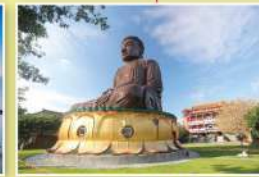
Mt. Bagua Great Buddha Scenic Area