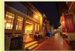
Lukang Old Street