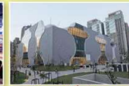
National Taichung Theater