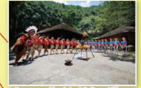
Formosan Aboriginal Culture Village