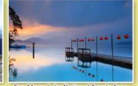
Sun Moon Lake National Scenic Area