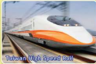
Taiwan High Speed Rail