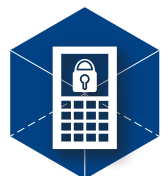
Digitized key-lock in every door