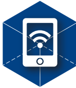
World's most wired city