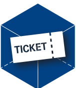
No more paper ticket