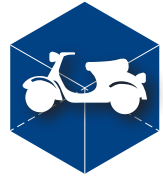
Food delivery from any place of the city