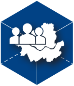
Half of the Korea's population live in Seoul