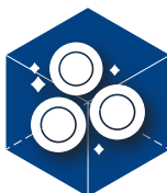
Unlimited colorful Side Dishes